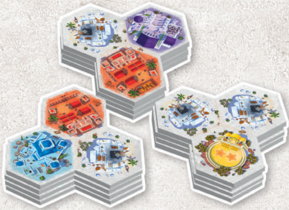
61 City tiles