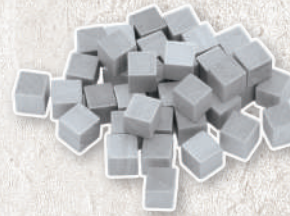
40 Stone cubes