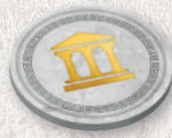
Chief Architect marker