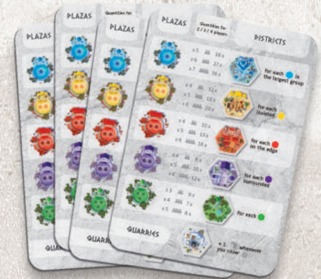
4 Player aids