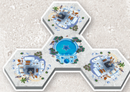
4 starting tiles